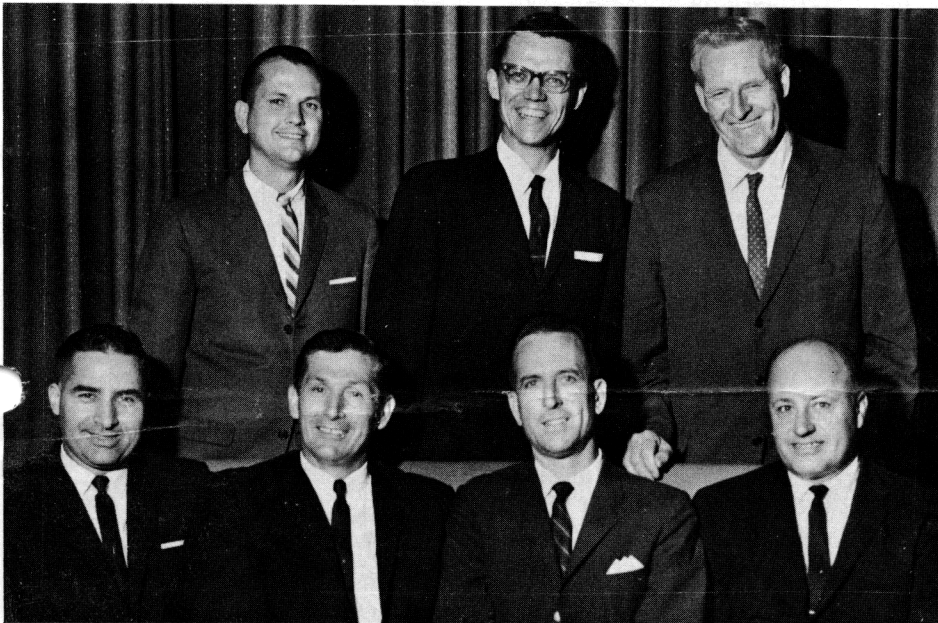
NEW SPOKESMAN CLUB OFFICERS—CHICAGO AREA